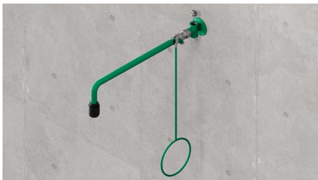
BR 082 0X5