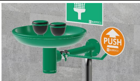
BR 300 0X5